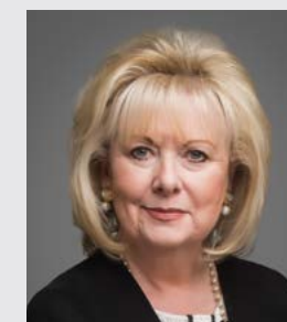
Dr. Pamela Wallin, Senator