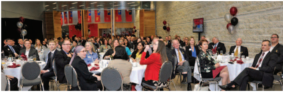
U of R Photography