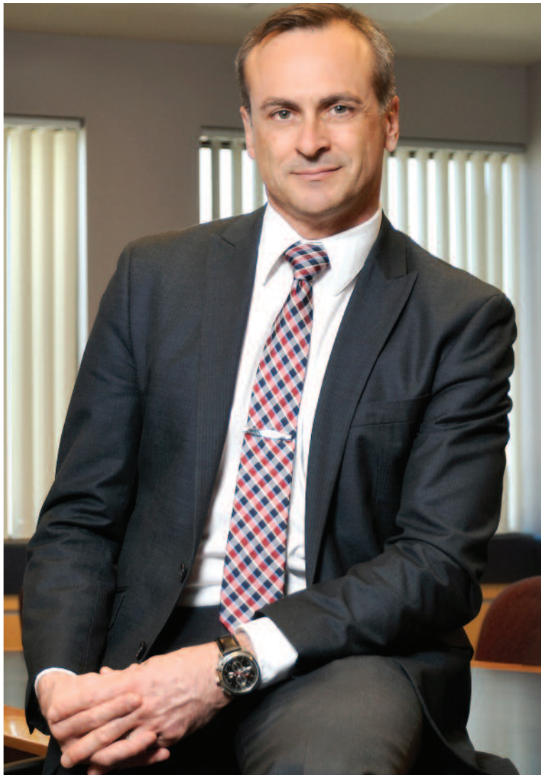
U of R Photography

I'M PARTICULARLY PROUD OF THE RESOURCES WE HAVE BEEN ABLE TO ASSEMBLE FOR RESEARCH SCHOLAR APPOINTMENTS VIA FINANCIAL SUPPORT FROM OUR LOCAL BUSINESS COMMUNITY.