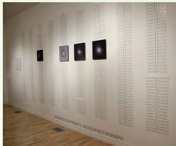
ABOVE: INSTALLATION VIEW