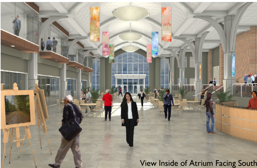
View Inside of Atrium Facing South

The hub of the LOC will be a new Executive Education Centre that will equip the Centre for Continuing Education, Johnson Shoyama Graduate School of Public Policy and the broader community with state of the art meeting rooms for groups ranging from 20 to 300.