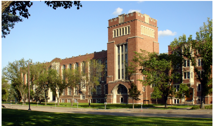
New Atrium Between Conservatory and Darke Hall

The Campus will be known as the University of Regina Leadership and Outreach Centre (LOC) . Integrating academic programming with outreach and training for both public and private sector professionals, it will serve as a Provincial and National destination.