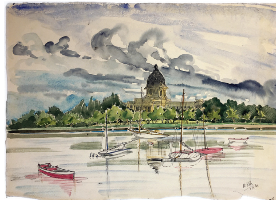
Left: Untitled (1942) Drawing/sketch – wax crayon on paper Painting – watercolour on paper