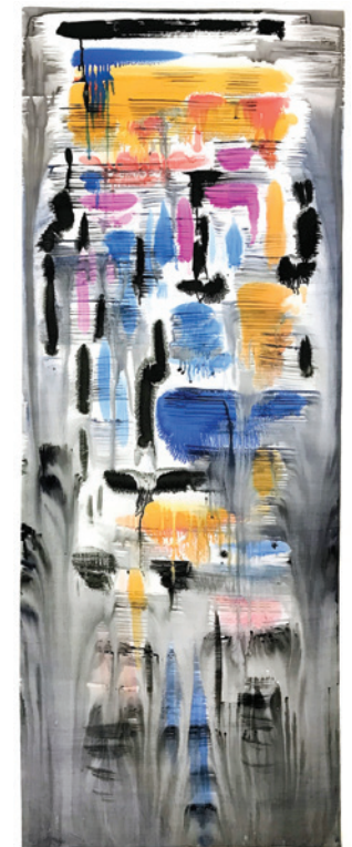
Right: Untitled (1985) Watercolour on paper