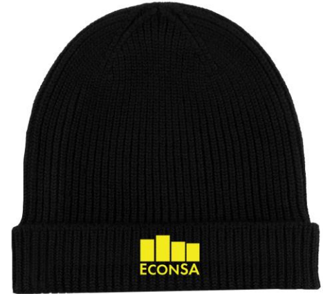
Newly Launched Econ Merch.

This semester we are launching a new ECON Social Hour every Friday at 1 PM in the Lazy Owl. Everyone is welcome to drop by, grab a drink or an appy, and hang out with other economics enthusiasts. Later in the semester, we plan to have another Drinks with the Profs event with complimentary food and drinks paid for by the Association, date TBD.