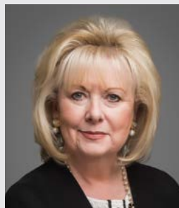
Dr. Pamela Wallin, Senator