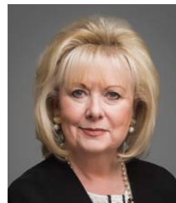
Dr. Pamela Wallin, Senator