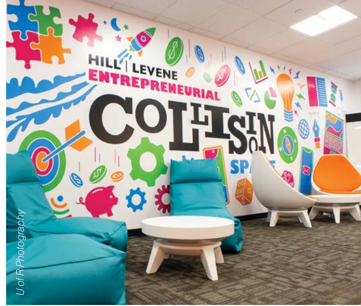
Hill Levene Entrepreneurial Collision Space

The Hill Levene Schools' reach in the area of applied entrepreneurship is deep and wide. The Hill School offers a unique certificate in entrepreneurship, the Ideation, Creativity and Entrepreneurship (ICE) Certificate. While it is relatively new, interest in it is growing quickly among business and non-business students across campus. The Schools have long been champions of the Enactus student group at the University of Regina, an award-winning entrepreneurship and social innovation club, that has been recognized regionally and nationally for its social enterprise ventures such as SaskMasks and Fifo. The Schools have also partnered with Prince's Trust Canada for the last decade to deliver Operation Entrepreneur (OE) to deliver a week long entrepreneur 'boot camp' to veterans and military personnel transitioning out of the Canadian Armed Forces and looking to start new businesses. This Fall the Schools will be taking work-integrated programming in entrepreneurship to a new level through the Hill Levene Centre for Experiential and Executive Learning (CEEL).