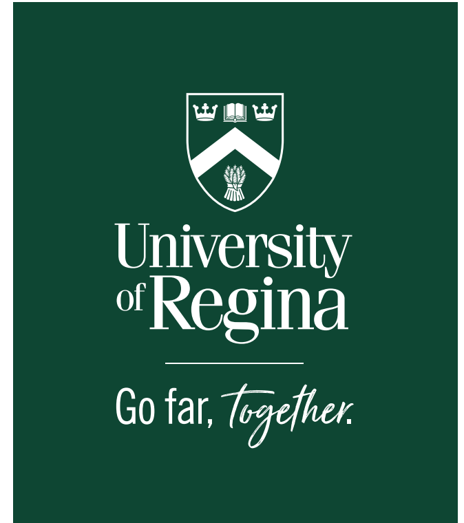
STACKED VERSION – REVERSE