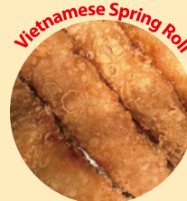
Vietnamese Spring Roll