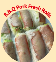
B.B.Q Pork Fresh Rolls