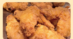
Deep-Fried Chicken Wings