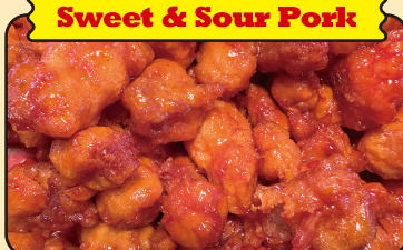
Sweet & Sour Pork