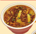
Hot & Sour Soup