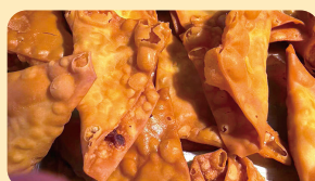
Deep-Fried Wontons (pork)