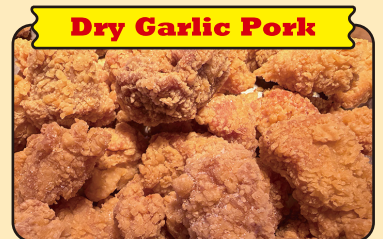
Dry Garlic Pork