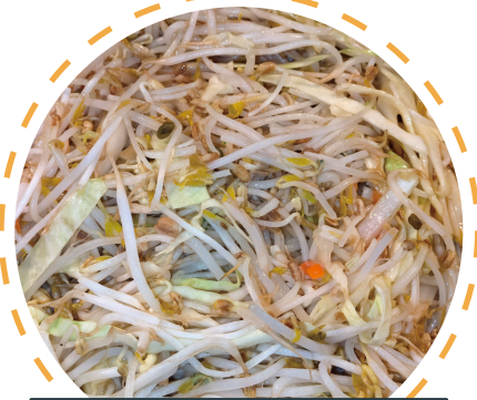
Chop Suey (Bean Sprout)

Mixed Vegetables, Chicken / Pork / Beef / Shrimp / Special (Chicken, Shrimps and Pork)