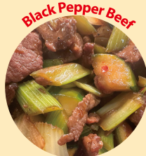
Black Pepper Beef