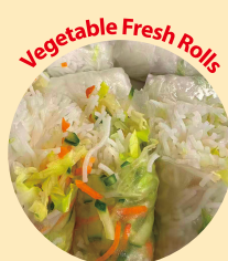
Vegetable Fresh Rolls