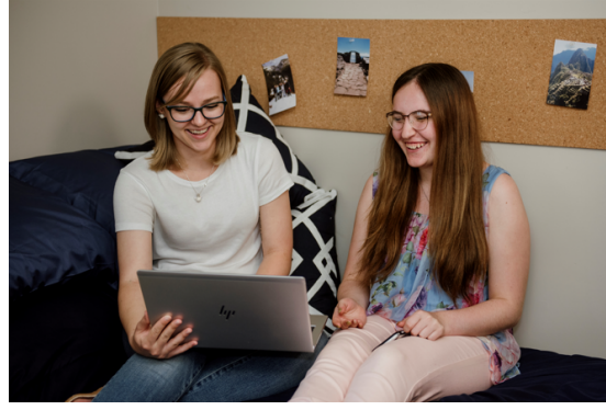
The Student Village at Luther College