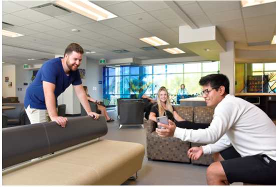
U of R Housing Services