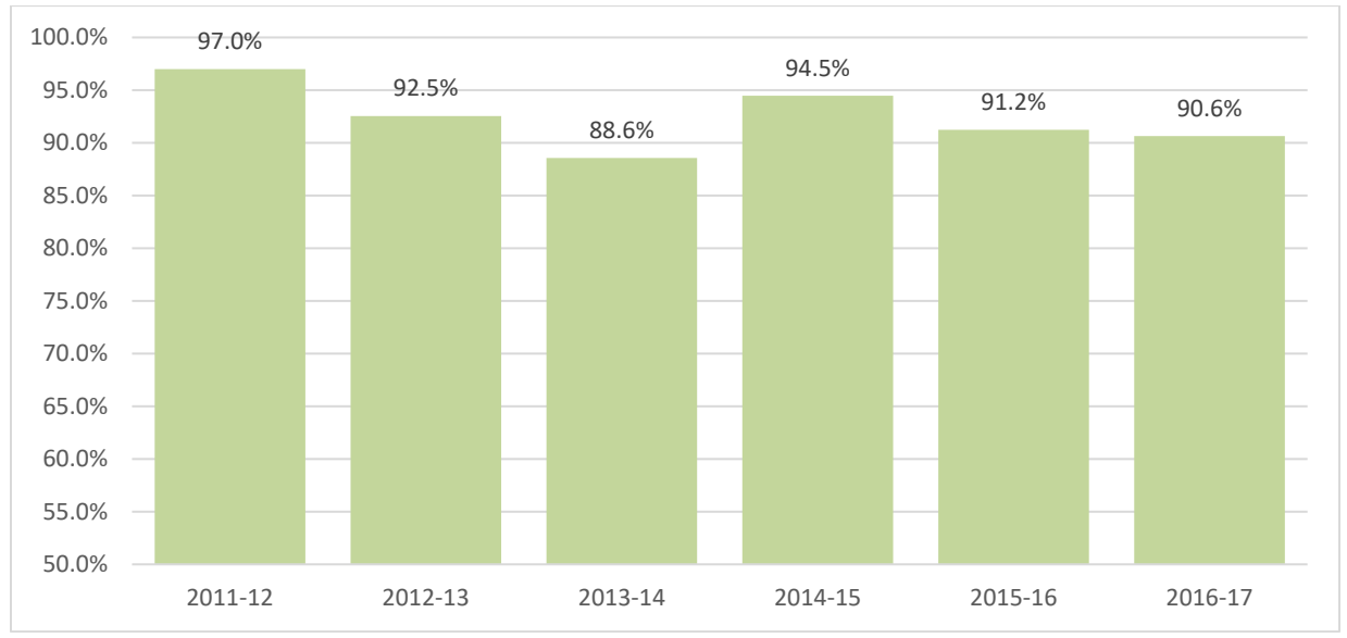
Figure 1: Expenditures on Administration Per FTE: Comparison of "National Norm", by Fiscal Year.

Figure 1 above shows the same "national norm" comparison analysis as in table 1 and for the past 5 fiscal years. The University of Regina, relative to the national norm comparisons, has seen its ratio of administrative and external relations expenditures remain below what would be anticipated in the model. For 2016-17, this ratio declined suggesting the following: the University of Regina has reduced or reigned in administrative expenditures; increases in enrolments have outpaced administrative expenditures; or, administrative expenditures at other institutions in Canada have grown more quickly than those at the University of Regina over the time period.