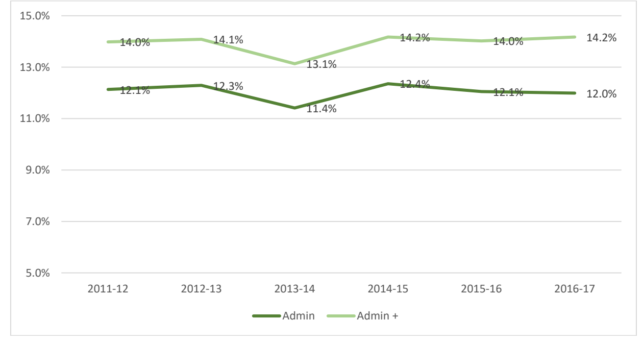
Figure 3: Administration Expenditures as a Proportion of Operating Expenditures, by year.

The analysis above simply calculates the expenditures by the University of Regina on administration and external relations per FTE in inflation adjusted dollars. The Administration and External Relations expenditures are based on reporting categories defined by CAUBO and reported to Statistics Canada. FTE's are based on internal counts as of the 4th week of classes in the fall semester for each year and include federated college FTEs.