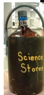
Rubber solvent bucket